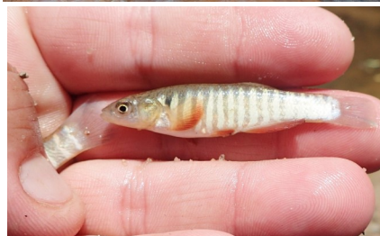
Plains Killifish from Salt Fork...

Over 200 were caught, 98% were freed to continue their Salt Fork life.