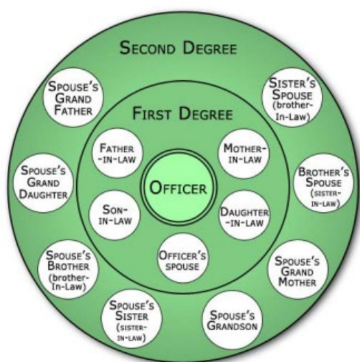
AFFINITY KINSHIP Relationship by Marriage

Board members are prohibited from hiring relatives within the third degree to any board member or themselves. If an employee is already in service to the district prior to a board member being elected or appointed, the employee may continue to serve. However, the related board member must recuse themselves from participating in any decisions and discussions that directly affect the employee.