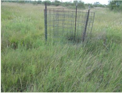
Practice of Monitoring Grazing Panel under CSP.