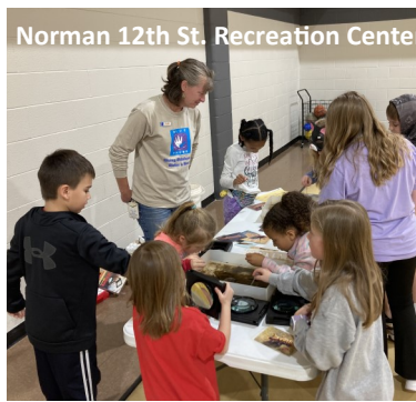
Norman 12th St. Recreation Center