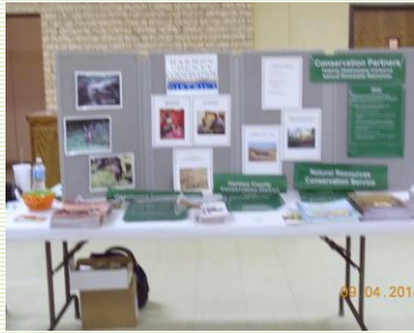
Harmon County Conservation District sets up an Educational outreach booth at the Harmon County Fair annually.