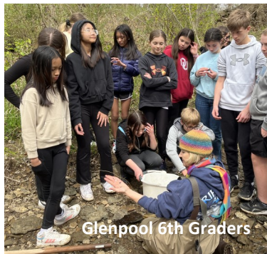
Glenpool 6th Graders