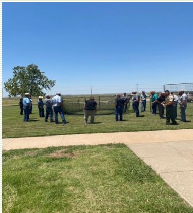
Oklahoma Wildlife Department demonstrating to the attendees one of the two Feral Hog Traps presented at a Feral Hog meeting held at the Altus Vo-Tech Center for Harmon and Jackson Counties..