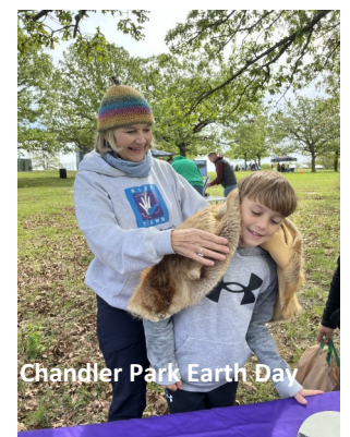
Chandler Park Earth Day