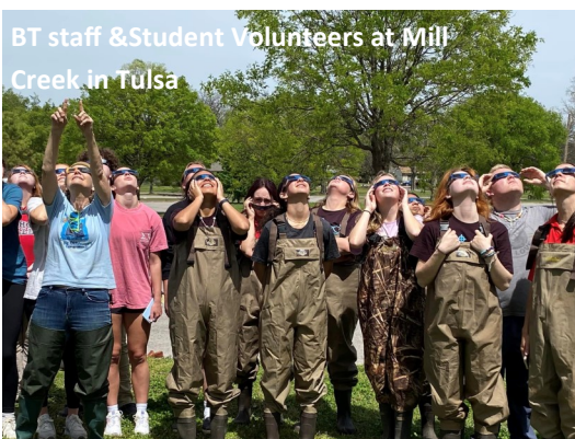
BT staff & Student Volunteers at Mill Creek in Tulsa