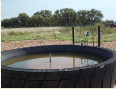
Water Facility with HUAP installed for producer through State Cost Share Program Year 18.