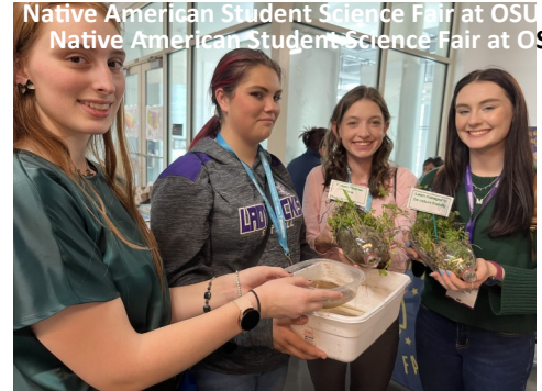
Native American Student Science Fair at OSU Native American Student Science Fair at OSU