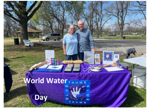
World Water Day