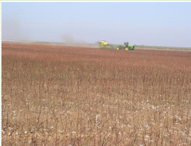
Producer using No-Till farming instead of conventional till farming.

selected to participate in the Regional Air Quality Initiative along with several Texas counties. It provides producers with program support for practices that address agricultural air emissions such as particulate matter, ozone precursors, odors and greenhouse gases. There is also the Strike Force initiative, the goal of which is to better served USDA's identified persistently impoverished counties and provide resources to historically underserved producers, which include limited resource farmers & ranchers, beginning farmers and ranchers, socially disadvantaged producers, veterans and Tribes. Harmon County also received EQIP Funding through a Groundwater Conservation Local Emphasis Area for Irrigation system efficiency improvements.