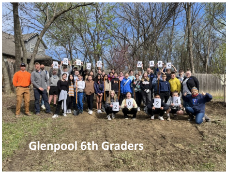
Glenpool 6th Graders