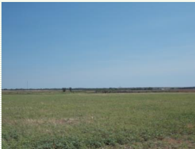
Grass Planting is a practice that is listed for cost sharing to producers.