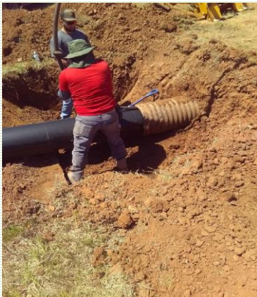
Tri-County Turkey Creek Watershed Site #11 getting repairs to Pipe Slip.

in the county providing money in cost share funds for conservation practices such as grass planting, pond, terraces,