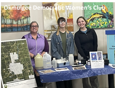
Okmulgee Democratic Women's Club