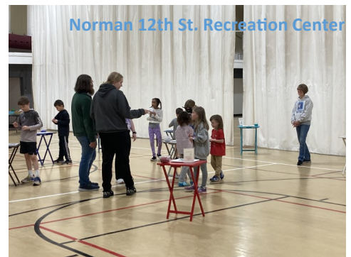
Norman 12th St. Recreation Center