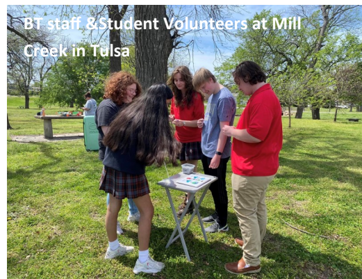
BT staff & Student Volunteers at Mill Creek in Tulsa