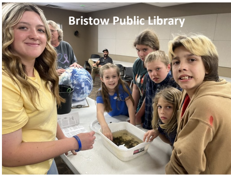
Bristow Public Library