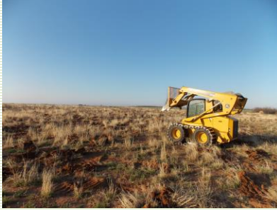
District clearing brush on producers pasture with the Marshall skid steer attachment.