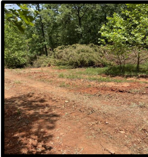
Red Cedar Coverage Before

Internal Partnership with neighboring county watershed staff to help maintain and service their watersheds.