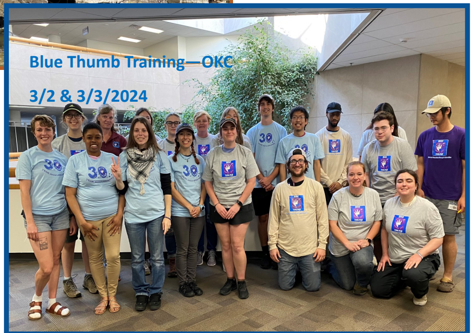
Blue Thumb Training—OKC