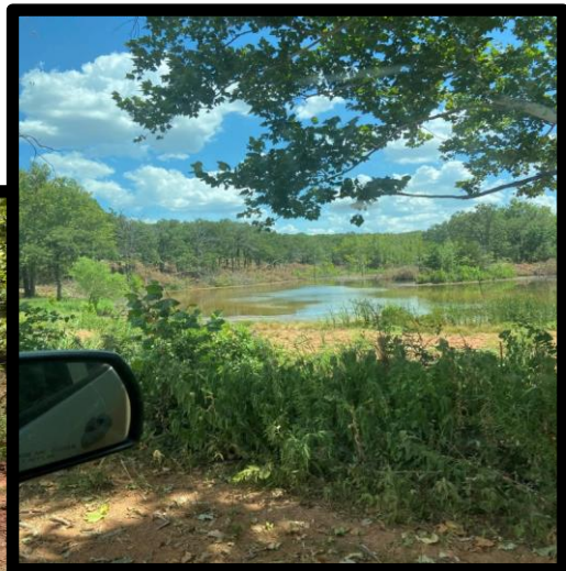
Canopy Clearance View