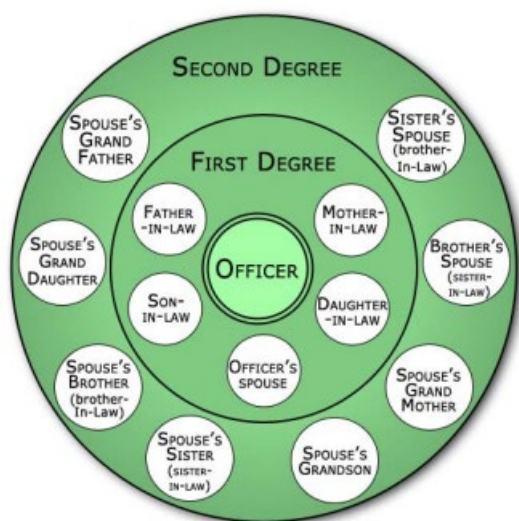
AFFINITY KINSHIP Relationship by Marriage

Board members are prohibited from hiring relatives within the third degree to any board member or themselves. If an employee is already in service to the district prior to a board member being elected or appointed, the employee may continue to serve. However, the related board member must recuse themselves from participating in any decisions and discussions that directly affect the employee.