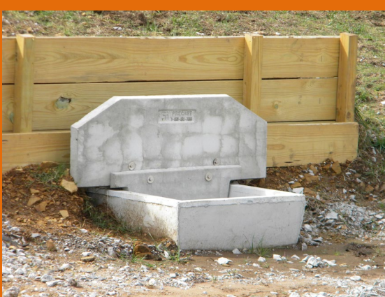
Pond with freeze proof tank