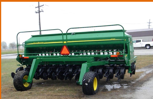
10' John Deere No-Till Drill