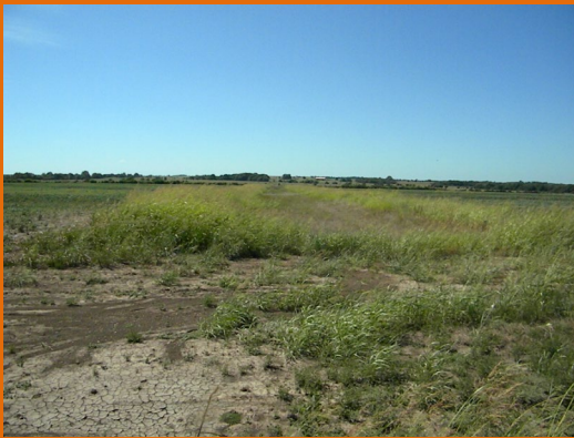
Grassed Waterway RCPP