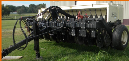
10' Truax No-Till Drill