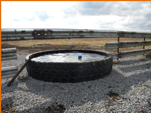
Rubber Tire Tank