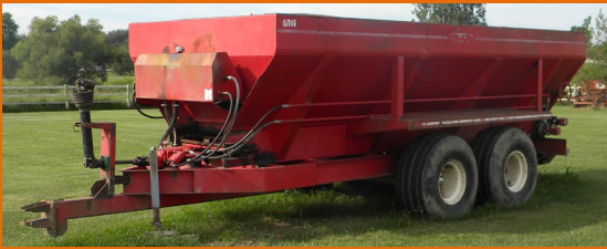
Barron & Brothers 16' Chicken Litter Spreader