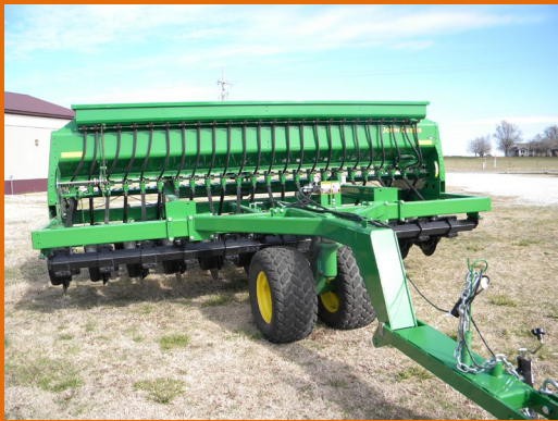
15' John Deere No-Till Drill