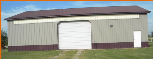
The district owned warehouse.

The district has also built a shop/warehouse in 2004 to help store equipment, store NRCS ATV/UTV, any needed supplies and has the room to work on any of the equipment. This shop was built with locally earned funds.