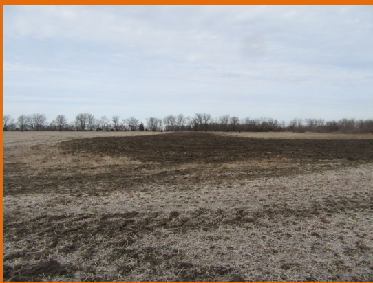
RCPP Project: Land Smoothing