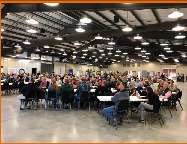
Craig & Ottawa County Conservation Districts co-hosted an Agricultural Trade Show.