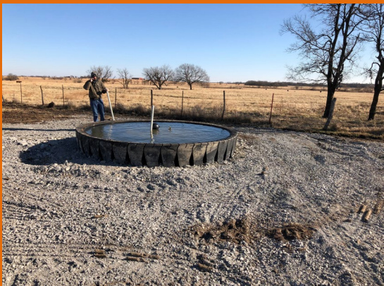
Livestock Water Facility