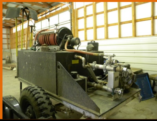
Danko Fully Equipped prescribed burn trailer with a 250 gallon tank with a Honda motor