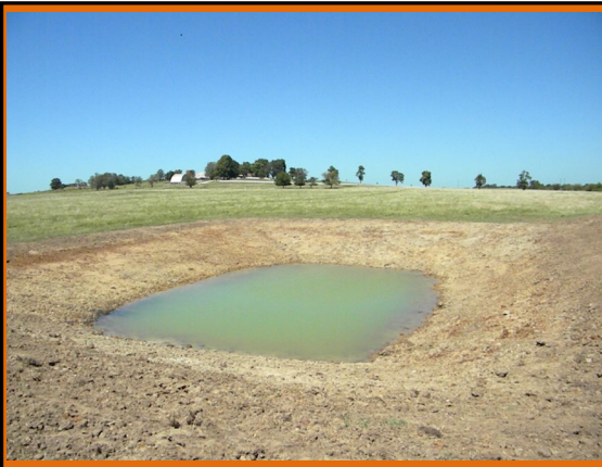
Pond constructed through cost share.