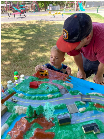
Top left: Kids at the annual GRDA camp in Langley.