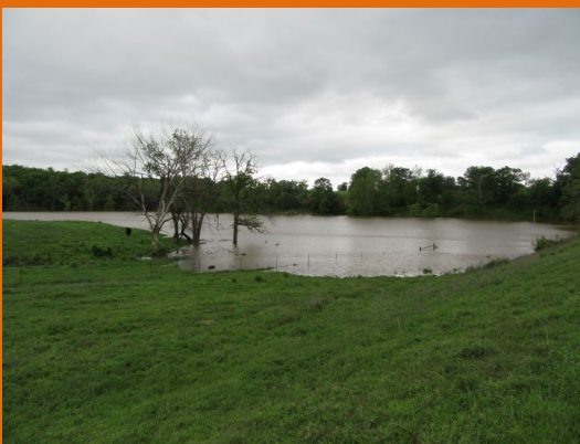
Pryor Creek Watershed Site No.

Pryor Creek Watershed Site No. 29 is located in Southwest Craig County.