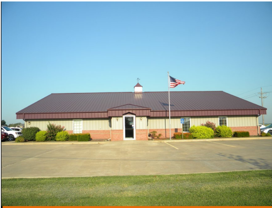
CCCD owned building.