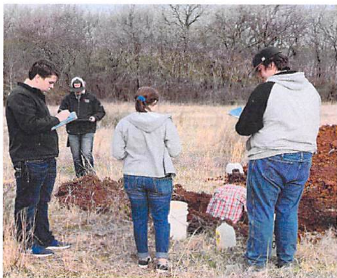
Students participating the in Garvin Land Judging contest.

Students from Lindsay, Paoli, and Stratford participated in the annual Garvin County Land Judging contest this year. The district sponsors the awards for the contest each year.