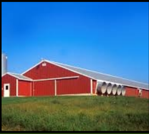
Arkansas Discovery Farms