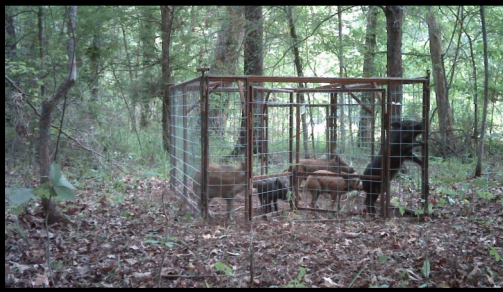
Feral Hog Eradication Program