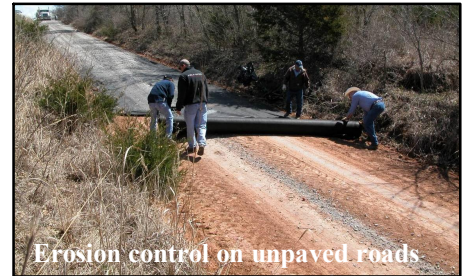
Erosion control on unpaved roads

OCES facilitated numerous educational events, including a sediment control class for City of Stillwater personnel and developers which addressed urban storm water and sediment control on construction sites. Pesticide and fertilizer education programs were conducted to educate the community about proper household, lawn, and garden use of fertilizer and chemicals.