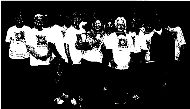
Brand new volunteers who attended the Cherokee County Blue Thumb training (October 20 & 21) are ready to begin monitoring on their own streams.