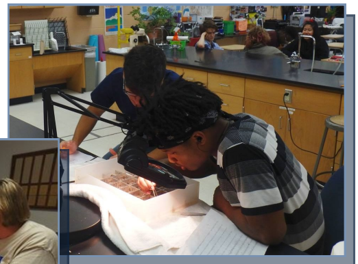
Right—Students at Edmond North High school search for the elusive mayfly.