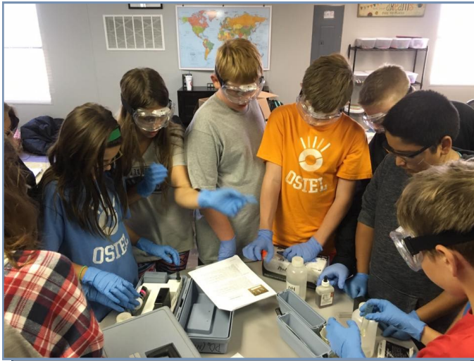
Top — Students at the Oklahoma School of Innovation and Experiential Learning (OSIEL) get ready to perform their quarterly quality assurance session.

The OSIEL students below look for benthic macroinvertebrates, remove them from the sample and keep track of how many they have found. The bugs will then be sent to a taxonomist for identification.