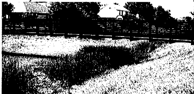
Streambank restoration portion of Brookhaven Creek project