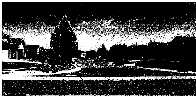
Demonstration street with low impact design