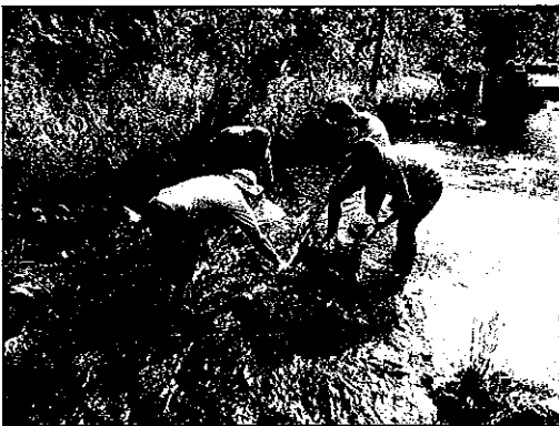
Reporters got a close look at many different macroinvertebrates!