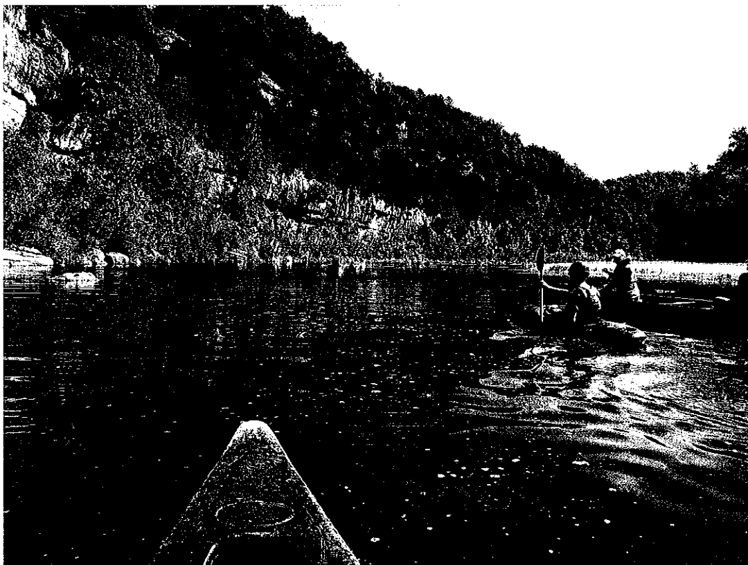
Cheryl Cheadle attended an “Art of Mentoring” workshop held in the Ozarks of Arkansas September 9—15. The point of the workshop was to provide guidance that attendees can use to help others form an important connection with nature.