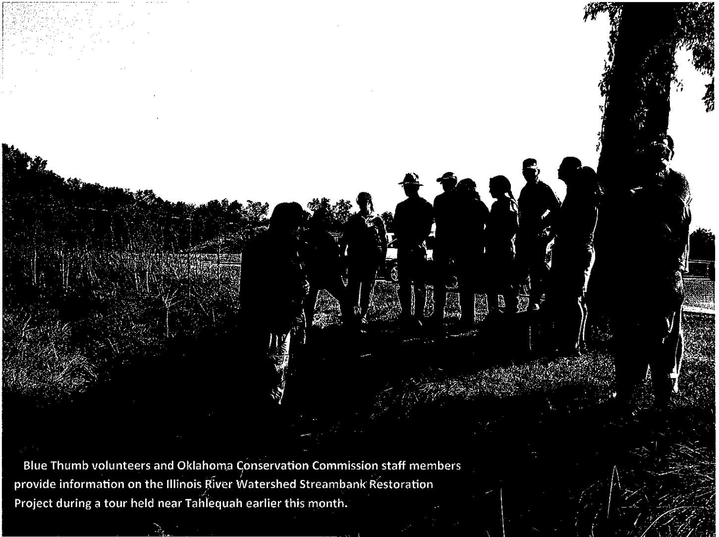
Blue Thumb volunteers and Oklahoma Conservation Commission staff members provide information on the Illinois River Watershed Streambank Restoration Project during a tour held near Tahlequah earlier this month.