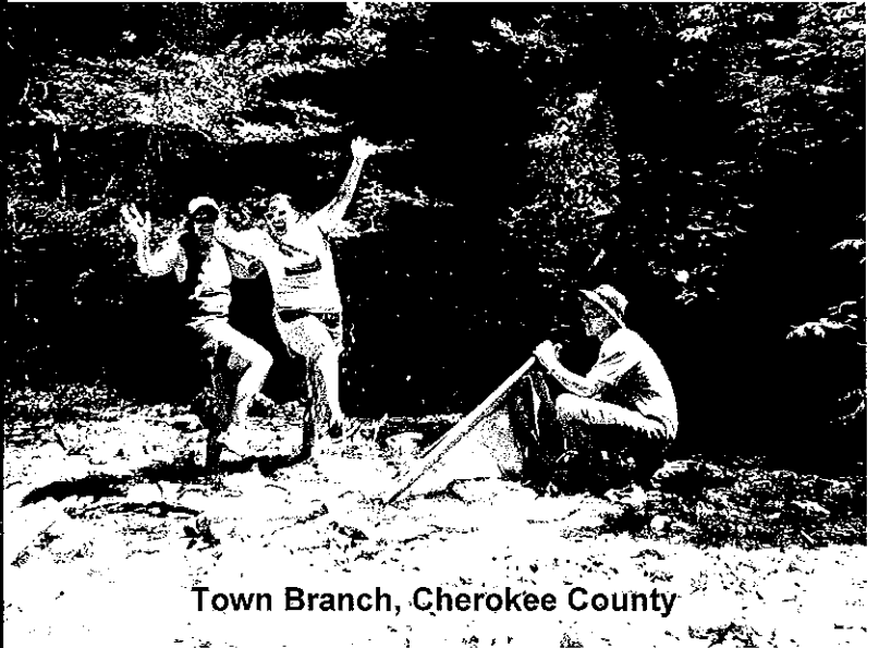
Town Branch, Cherokee County