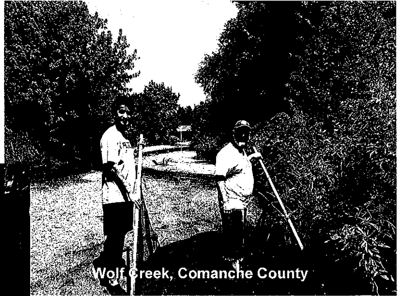
Wolf Creek, Comanche County