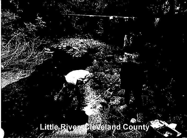
Little River, Cleveland County