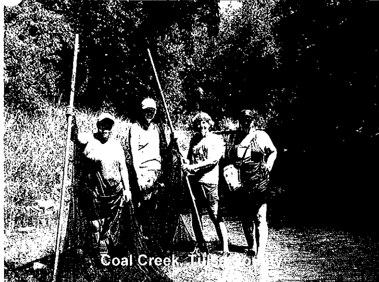
Coal Creek, Tulsa County