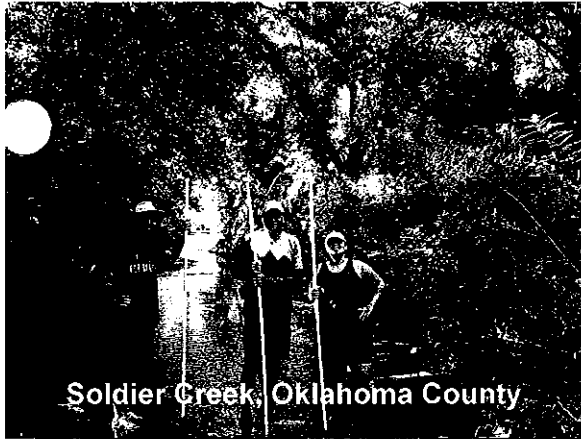
Soldier Creek, Oklahoma County

Biological collections are taking place at streams across Oklahoma! In addition, volunteers are performing their dissolved oxygen test as their quality assurance effort.