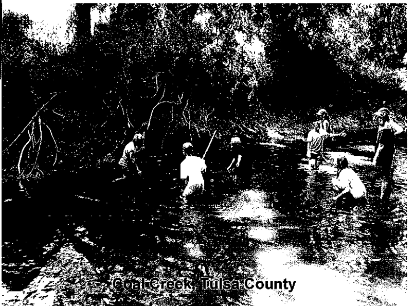
Coal Creek, Tulsa County