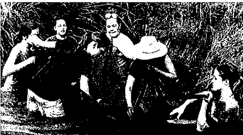
TechTrek STEM Camp participants (Southwestern State University, Weatherford) received an introduction to stream ecology as part of their science activities on June 14. Half of the group is shown below.