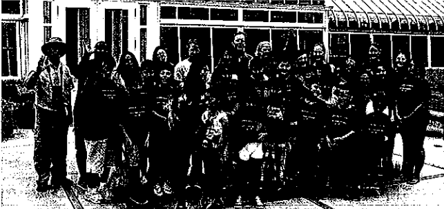
Students and instructors for Eugene Field Elementary (OKC) STEAM Camp (sponsored by the Boren Mentoring Initiative) at Will Rogers Gardens. Right, Kim using the EnviroScape to teach students about pollution prevention at the camp.