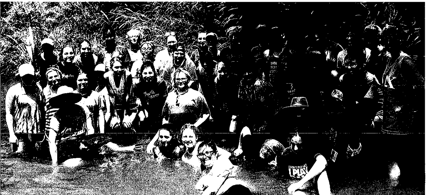
Never underestimate the value of putting students in a stream and giving them a net.