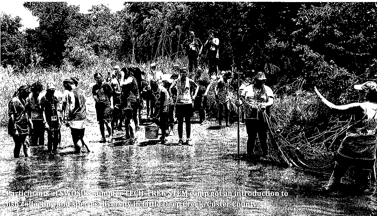
Participants at SWOSU's summer FISH-TRIP-STEM camp got an introduction to fish collecting and species diversity in the Deep Creek, Carter County.