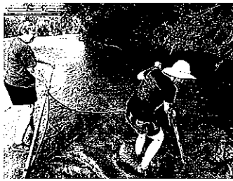
The whole Blue Thumb staff (plus trusty volunteer Jim Leach, with death grip on gar) attended the North American Native Fish Association's annual conference in Tahlequah. High water across the state added to the challenge in finding fish.