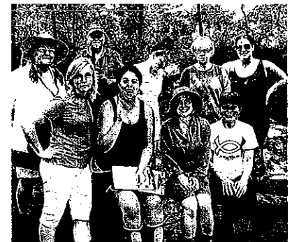
Summer camp workshop for elementary school teachers in Idabel, where they learned what lives in their stream!