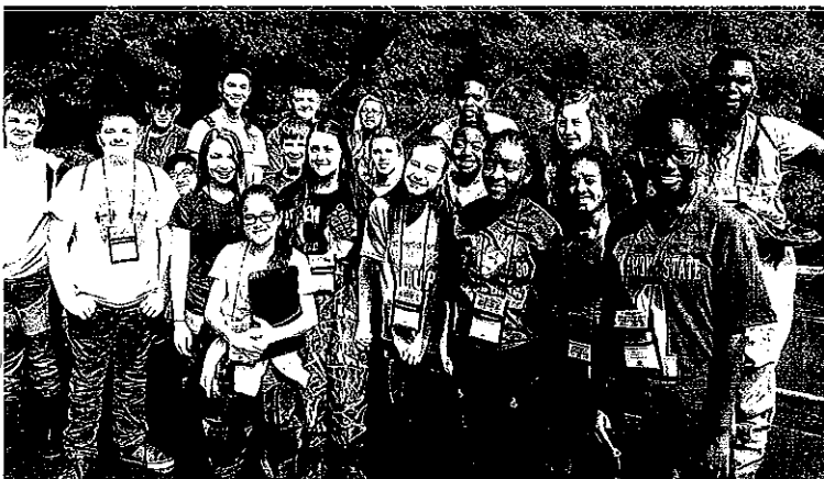
Okmulgee County high school students enjoy a summer camp outing to the Deep Fork NWR where they studied the creatures in the wetlands.