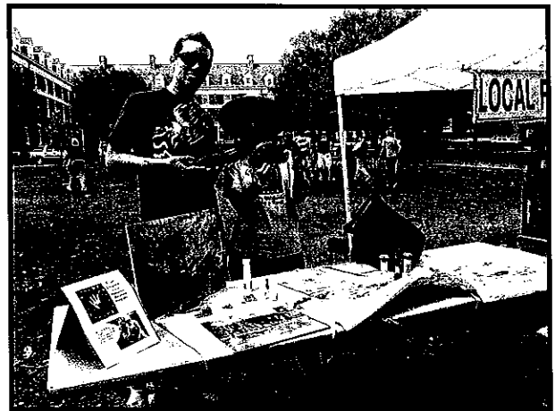
Above, Payne County volunteers showed up to help staff the Blue Thumb exhibit at the OSU Earth Day event on April 22.