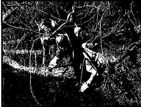
Caney Valley Conservation District students get to be "real scientists" as they try stream monitoring during their natural resource day (May 5 & 6) .

High School students from Edmond North HS work together to "pick" their bug sample.