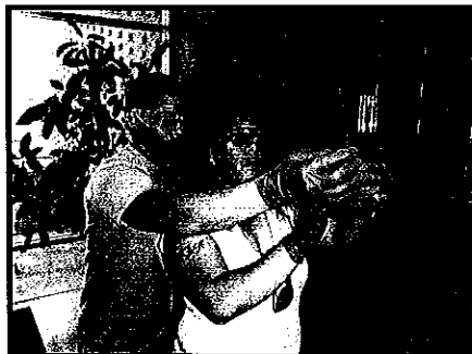
Right, Southeast High School's Blue Thumb students taught their parents a thing or two about stream monitoring on "Parent Day" last month in Oklahoma County.