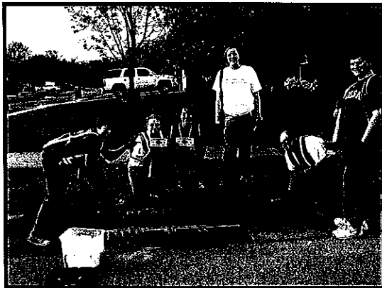
Blue Thumb curb marking remains a fun and popular activity for youth, as is demonstrated by these Jenks High School students.