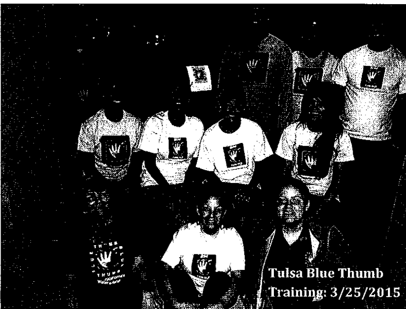
Tulsa Blue Thumb Training: 3/25/2015