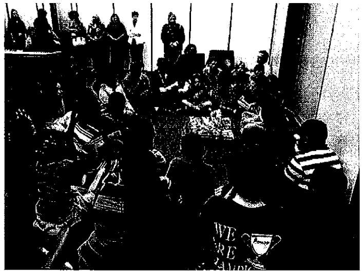
Top left—Participants from Haworth High School (Little River Conservation District) pose for the camera while they are receiving an introduction to Blue Thumb during a mini-academy offered by Candice.