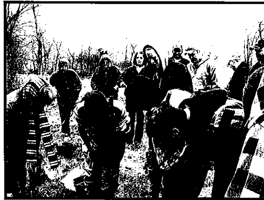
Left, Blue Thumb went to the Honey Creek Demonstration Farm on the 16th for the "Spring Outing." Everyone got a good look at what lives in the creek!

Several exhibits were staffed by Blue Thumb volunteers.