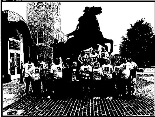
The Kay County Conservation District and the City of Ponca City worked together to sponsor a Blue Thumb training for new volunteers earlier this month.