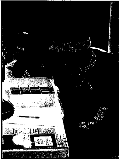
Blue Thumb worked with the Honey Creek Project and the Delaware County Conservation District at the FFA/4-H Conservation Fair held in conjunction with the livestock show.

Several exhibits were staffed by Blue Thumb volunteers.