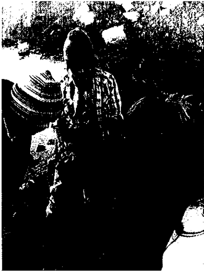
Left, students from Bartlett Academy in Sapulpa learn about the life among the rocks of a stream. Below, students from Paden Elementary School learn about water protection at a natural resource day.